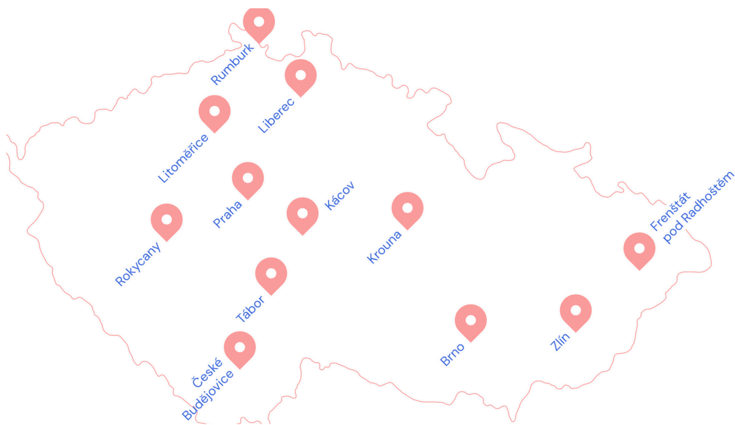
Figure 1 The places of practice of general practitioners who participated in the first session of the course and are now acting as so-called ambassadors.