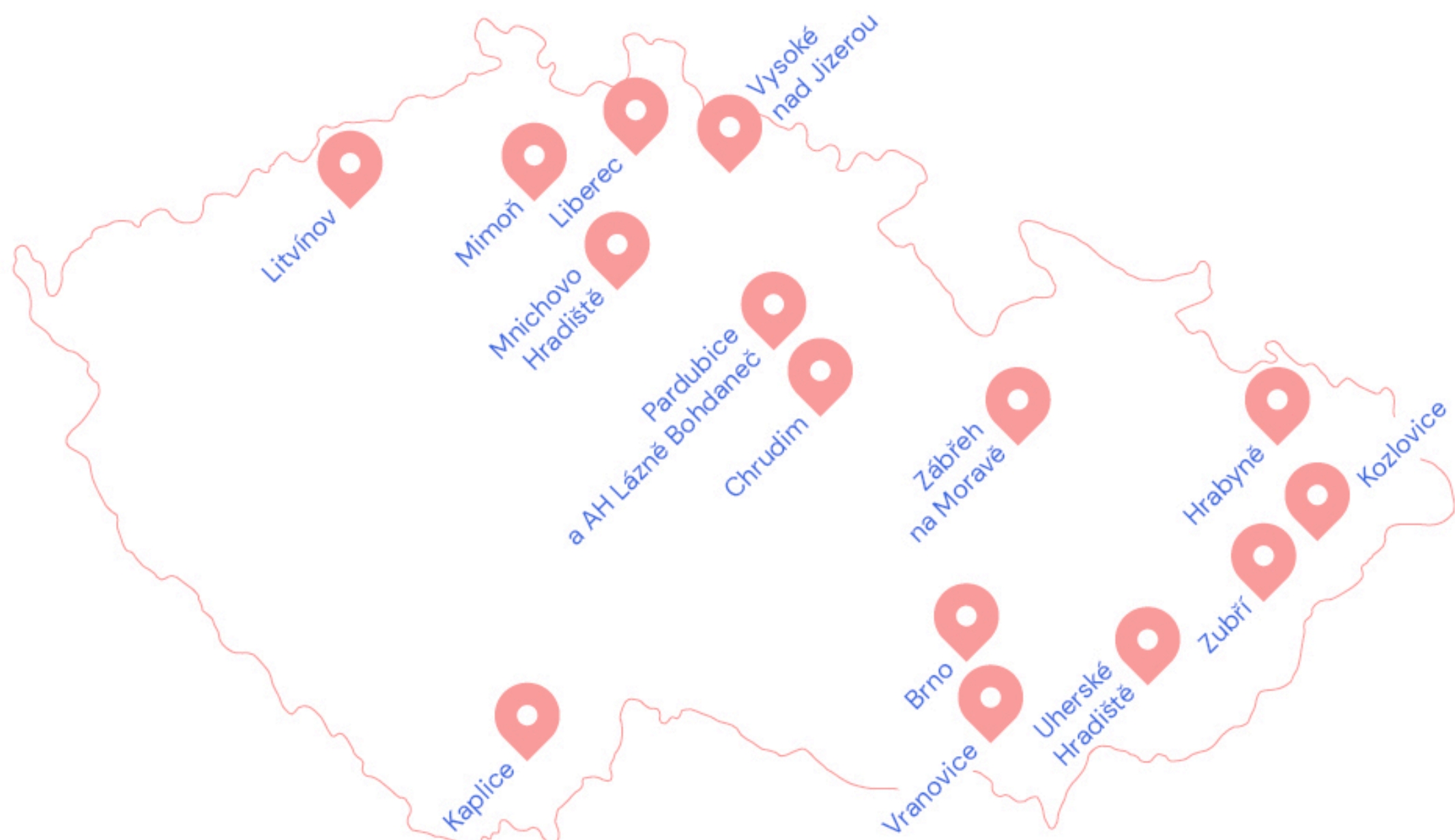
Figure 2 The places of practice of general practitioners from the second session of the course, again with an emphasis on locations with limited access to palliative care.